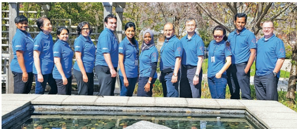
Omron Canada Volunteers

healthcare products. We thank them for their time and like the seniors, we look forward to seeing them again!